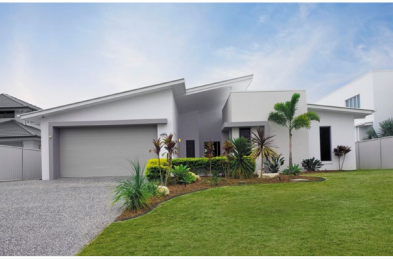
SECURITY & ALARMS